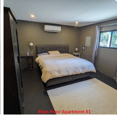
Main Floor Apartment #1