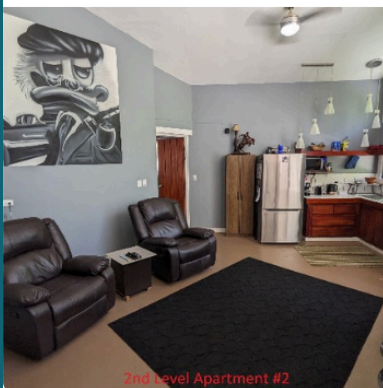
2nd Level Apartment #2