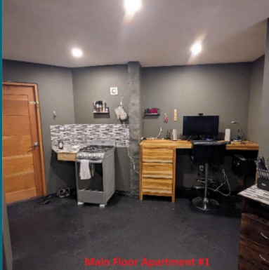
Main Floor Apartment #1