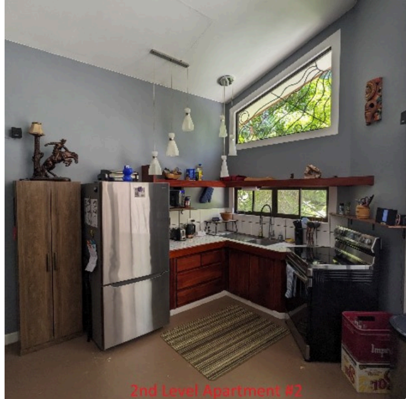
2nd Level Apartment #2

The centerpiece of this oasis is a large saltwater pool, complete with an enchanting waterfall. The pool and surrounding patio are beautifully lined with ceramic tiles, and a galley-style poolside kitchen makes entertaining a breeze. Enjoy the lush landscape adorned with mango, lime, and banana trees, where birds and butterflies add to the warm, inviting atmosphere of this tropical retreat.